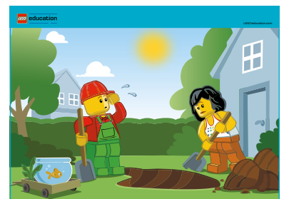
Use the illustration to support the Connect story