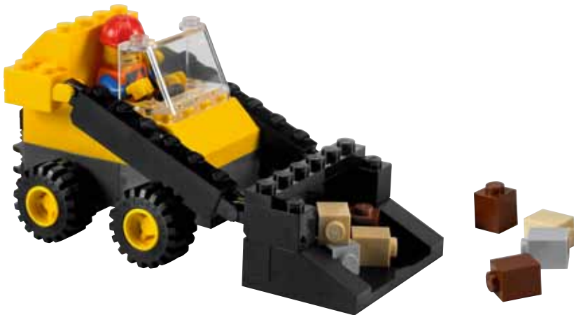
Suggested model solution