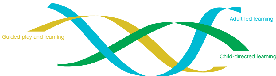
Fig 1 – Integrated teaching and learning approaches

Play-based learning and approaches such as inquiry-based learning, active and experiential learning are founded on the same learning theories. Central to these theories is the idea that educators and learners work together in partnership to co-construct knowledge. Learning environments are intentionally designed to maximize opportunities to foster creativity, social interaction, experimentation and a love of learning.