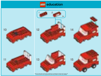
Can be used as inspiration