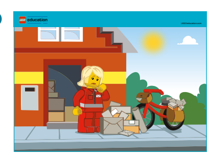
Use the illustration to support the Connect story