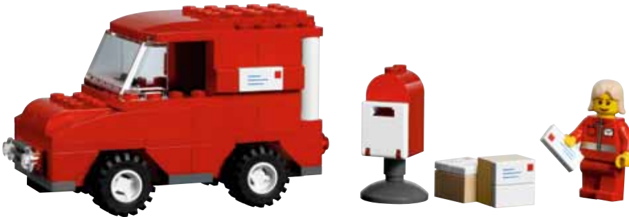
Suggested model solution