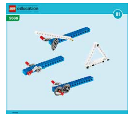
Principle models building instructions booklet for gears and pulleys