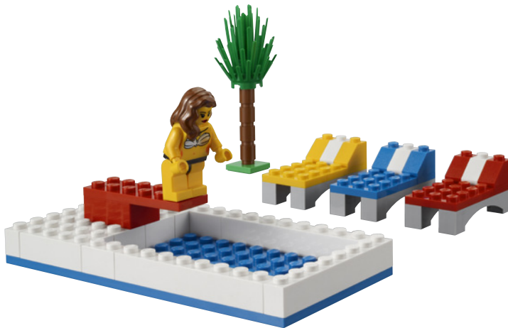
Suggested model solution